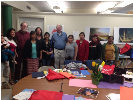
first group of ESL students that finished a full year of classes

In the 2013-14 Head Start / Early Head Start launched its first on site English classes for our non-English speaking population. In an attempt to help ease the confusion of a new land new language, we began preparing our families with everyday usage of the English language. Weekly, parent and their children came together to begin the process of understanding the how and why of our culture and language. Families came in three times a week and engaged in storytelling, reading about current events and teasing out the language . We finished the year with seven families that consistently came together and always looked forward to their English classes. To help mark this great beginning for our families we held an end of the year celebration that helped mark the success of our seven families and their beginning to endless opportunities here in America.